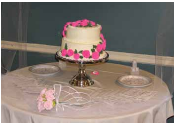
The Royal Wedding Cake!