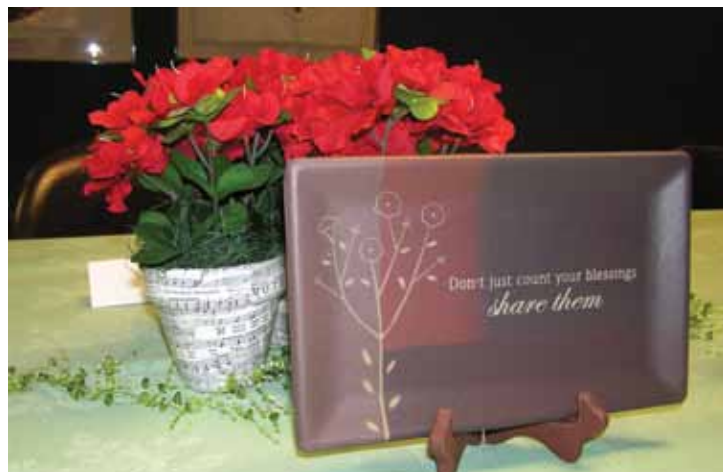
Gift given to the volunteers inscribed "Don't Just Count Your Blessings, Share Them."